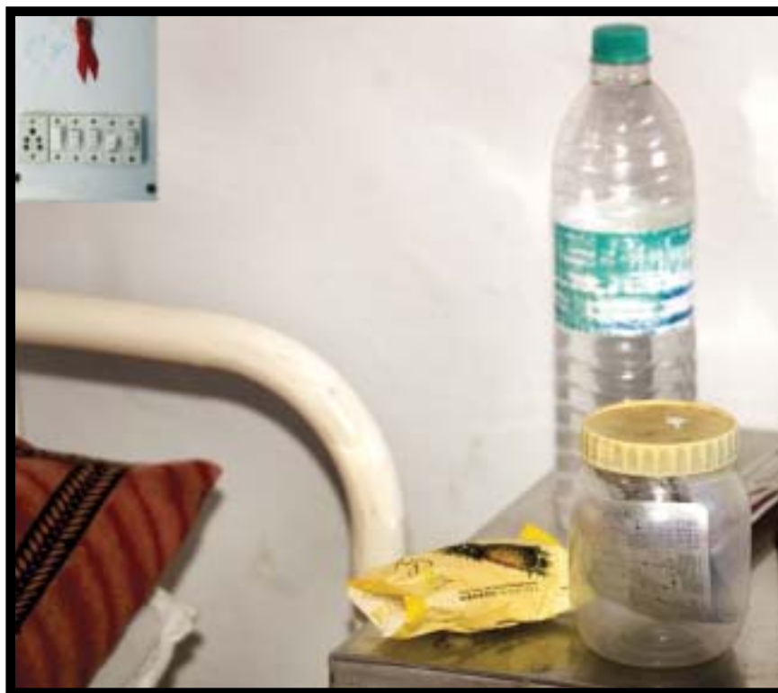
Table 1: Linkages

Both state-level consultations were attended by State AIDS Control Society officials, representatives from networks of people living with HIV and AIDS, NGOs working in the HIV and AIDS as well as water, sanitation, and hygiene sectors, functionaries from the two sectors, and representatives from funding agencies with programs on either sector operating in the state.